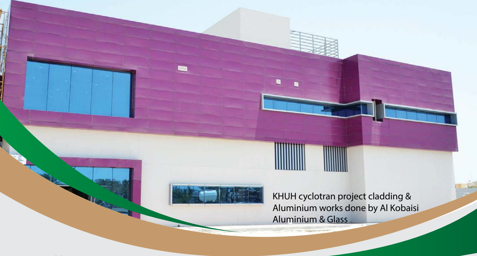
KHUH cyclotron project cladding & Aluminium works done by Al Kobaisi Aluminium & Glass